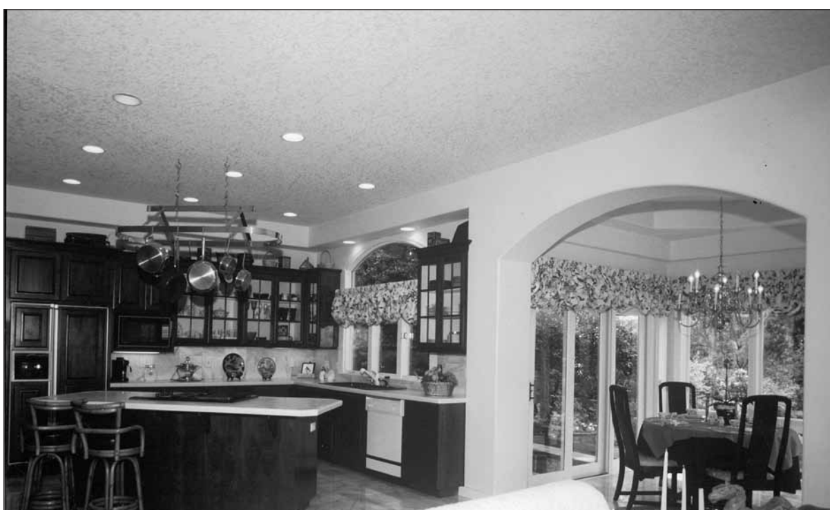
Before, at left, the kitchen within this home on Oswego Lake featured white walls, dated appliances and tile countertops and a broken sink faucet, but the layout was functional. So, keeping with the same imprint of the space, Ovation Design-Build updated cabinetry, colors, appliances and countertops — and, of course, added a new sink faucet.

See this home — and others — on the 2012 Tour of Remodeled Homes March 10 and 11. For more information and tickets, visit www.remodeltour-portland.com .